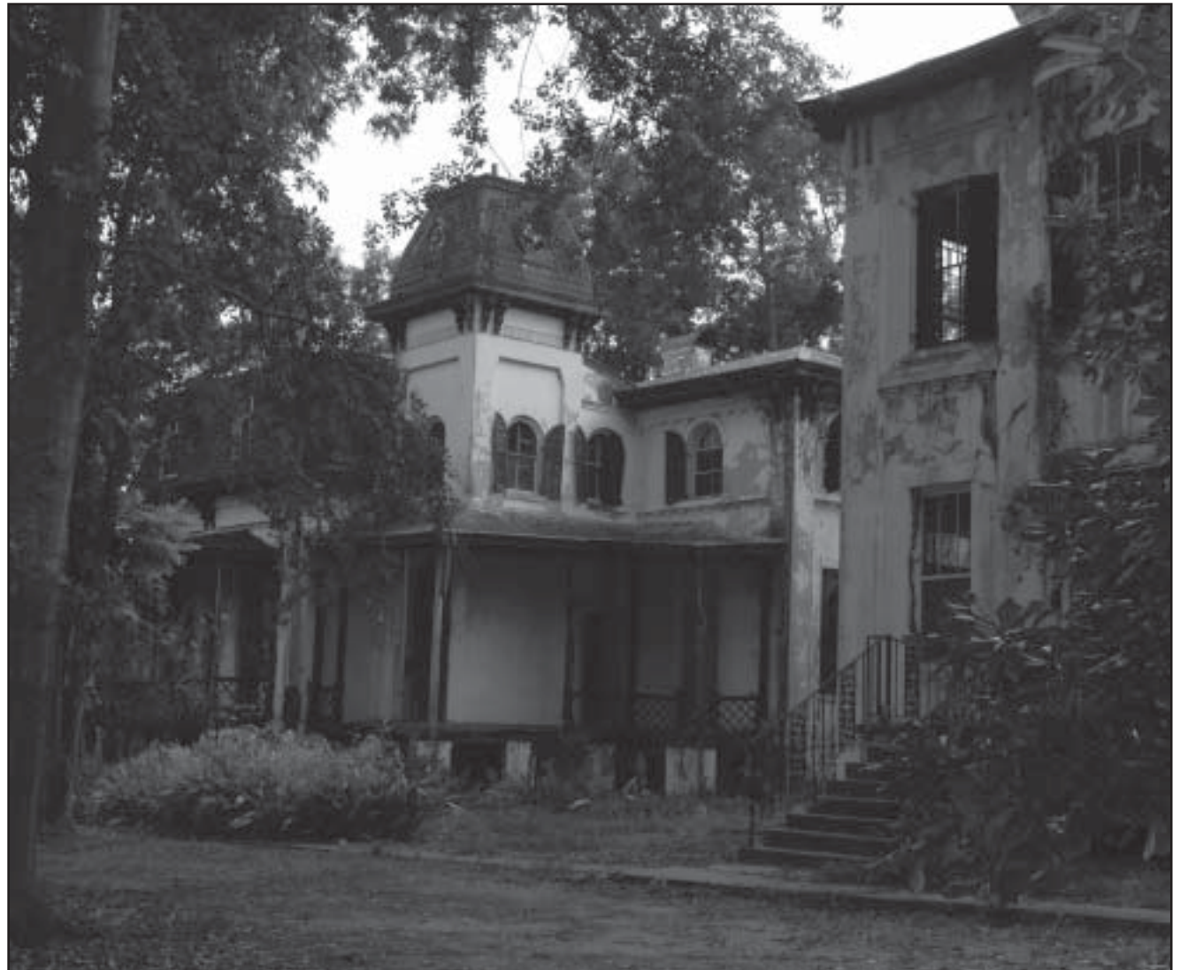
Winter Place late-June 2006