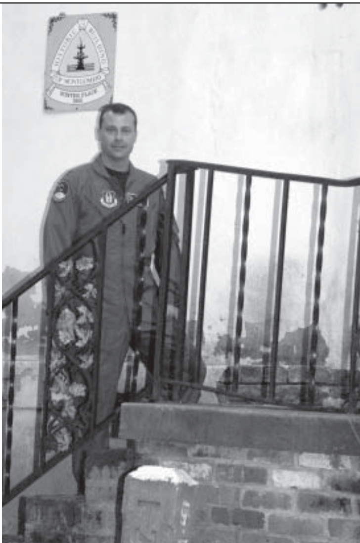
...ady recognized by the city and state as a historic building, last month Winter Place was added to the National Register.