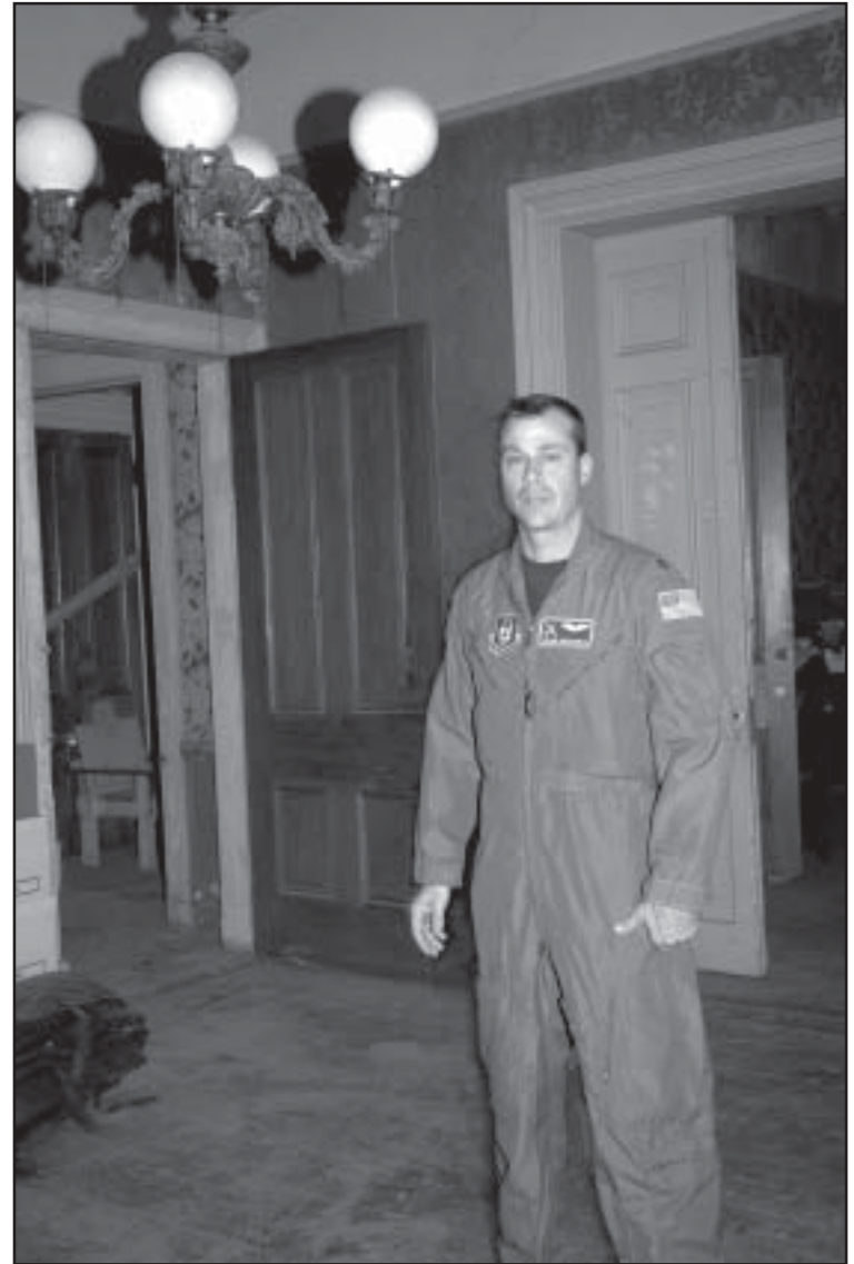
Drescher shows off an interior room