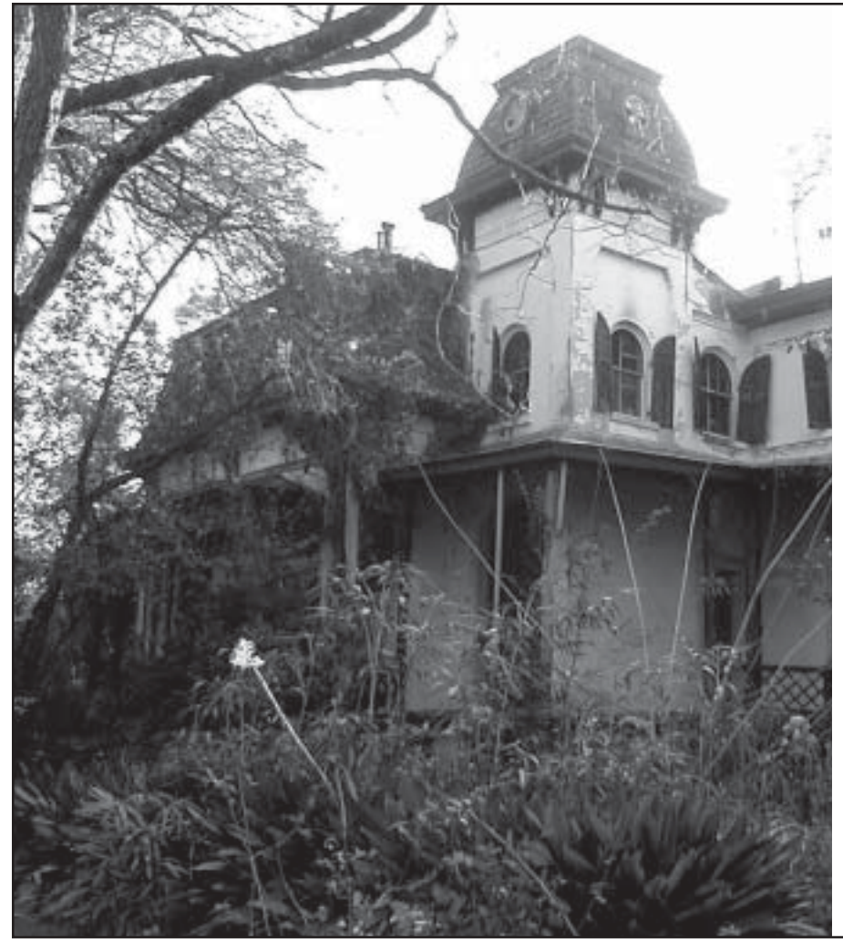
South House Winter Place circa August 2004.